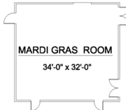
Mardi Gras Room